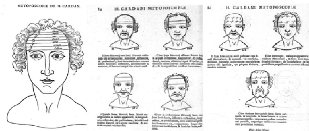
Illustrations from Metoposcopia libris tredecim by Gerolamo Cardano 4

astrological profiles of famous people 1 , and his Treatise on Dreams . These books influenced Sigmund Freud, who considered him a true pioneer 2 . In 1558, Gerolamo Cardano published an astonishing work on metoposcopy , that is, the analysis of personalities and characters 3 . It was very detailed book, with more than 800 illustrations and commentaries. He analyzed facial features and looked for geometrical shapes matching astrological symbols.