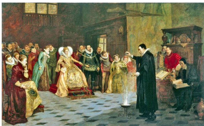
John Dee performing an experiment in front of Queen Elizabeth I. Painting by Henri Gillard Glindoni.

Finally, princes and men of power were irresistibly attracted by his reputation as an alchemist, probably hoping that he could manufacture gold for them. This gave him access to the European royal courts. The list goes on: Emperor Rudolph II, Stefan Batory - King of Poland and Grand Duke of Lithuania -, Charles V of Spain, Maximilian II of Hungary, etc. Even the Tsar of Russia offered him a fortune to become his adviser. John Dee refused, but his son Arthur Dee, also an alchemist, accepted 3 .