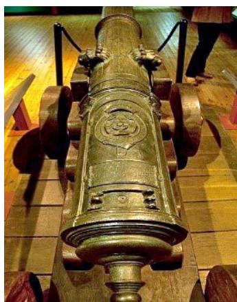
Bronze cannon of ship Mary Rose 4 . Reign of Henry VIII

At the beginning of his reign, King Henry VIII was obliged to import almost all his cannons 3 . They were made of bronze, cost a fortune, and were decorated like works of art. Iron cannons were cheaper, much heavier, and less reliable, because they frequently exploded, killing their operators. England did not have copper mines for manufacturing bronze, but it had many iron mines. Developing the technology of cast-iron cannons was therefore an imperative.