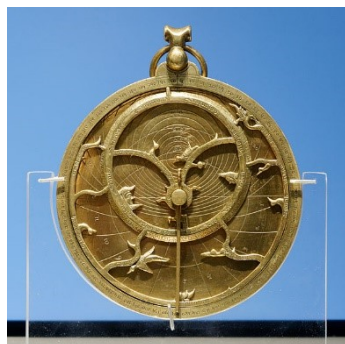
Astrolabe dated 1326, similar to the one described by Chaucer, British Museum. 6

In 1536, following the schism between the Church of England and Rome, king Henry VIII sold off the monasteries. Their libraries were destroyed or dispersed. Critical sciences to navigation such as cosmography, astronomy, and mathematics, were considered to be occult and condemnable magical practices 5 . In 1555, the scholar John Dee was arrested and accused of "calculating" the horoscopes of Queen Mary Stuart and Princess Elizabeth.