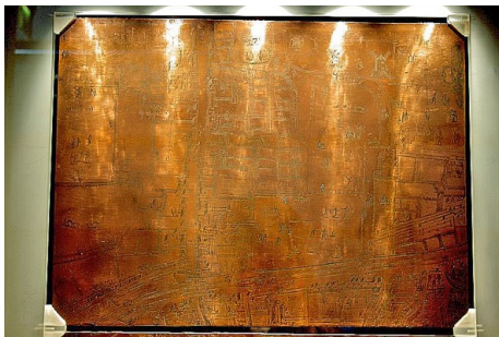
Copperplate engraving for printing a map of the city of London. Probably engraved in Holland between 1553 and 1559. 4

Good nautical charts were essential for upgrading from coastal navigation to deep-ocean travel. Elizabeth I and her ministers knew that it was impossible to establish colonies in the Americas without accurate maps. Around 1550, English cartography was primitive 1 . It was not until the 1570s that maps were published or that globes were built in England. When the pirate and explorer Francis Drake prepared his trip around the world, he had to go to Lisbon to buy maps 2 . The greatest cartographers were in Spanish Flanders together with the best craftsmen who knew how to finely engrave copperplates for printing presses 3 .